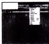
Measuring the parameters using imageJ software